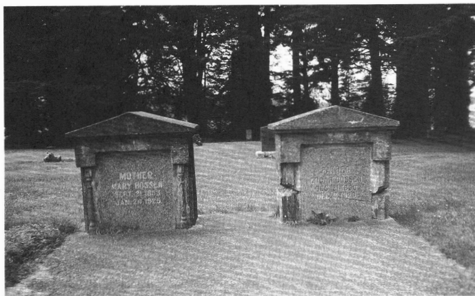
Denmark Dean H. Byrd (1996)

A ? 5 24 Dec 1886 T35S R14W S31 Located 0.5 of a mile north of Nesika Beach Junction between U.S. Hwy. 101 and Frontage Road. Lyman Woodruff was 60 years old. NOTE: No other information was given in the report. (Not shown on Ophir 1986 USGS Quad. maps.)