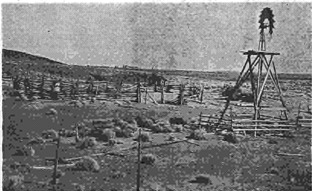
Part of Old West — Many of the old timers will recognize this picture. It was a "latter day" picture of the old Millican corral and windmill in Millican Valley, east of Bend. Note old cabin in background. In distance was "town" of Millican before it was moved.