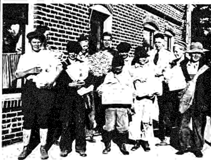
READ ALL ABOUT IT! - The boys here showing off their papers apparently were stopped for a picture just before heading down the street to sell papers. This picture was probably taken in front of the old Bulletin building on Wall and Franklin.