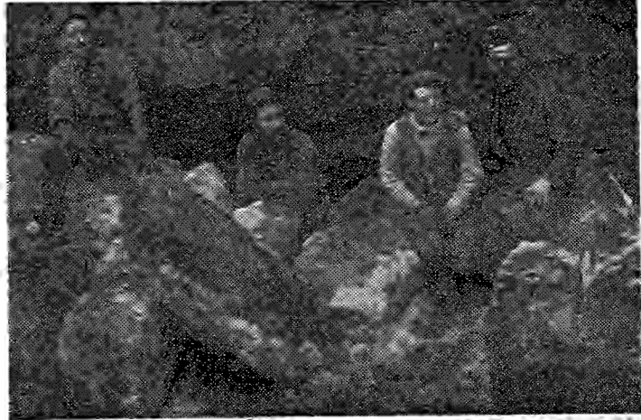
ICE FROM CAVERN — Some 50 years ago, Bend obtained most of its summer ice from Arnold ice cave. Note the huge chunks here that were cut from the cavern glacier, ready to be hauled into Bend.

Under the new set up, Bend residents were promised that mail reaching Shaniko by rail one evening would be in Bend the following morning by 6 or 7 o'clock.