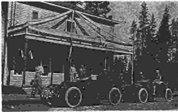
WHERE AWAY, MEN—Some intrepid motorists of early days are pictured here in front of the old Pilot Butte Inn, possibly ready for a drive into the mid-Oregon "wilds".